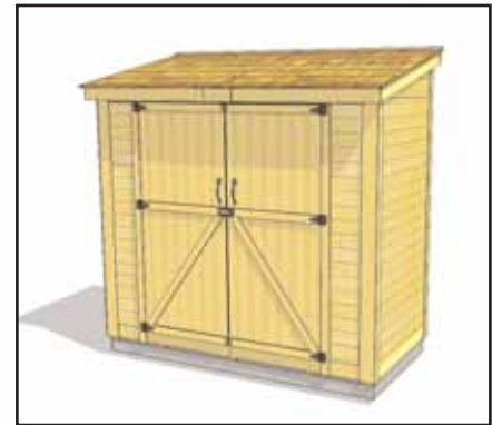
Double Door Model - No Window